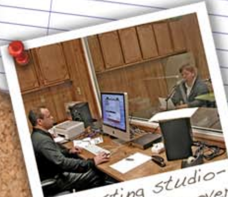
Podcasting studio- Recording voiceovers

In addition to offering career oriented classes, student tutoring, teacher training, as well as parent workshops, are being implemented to enhance the connections between school and work. Parenting classes/workshops provide information and instruction for the participant's family members in parenting and technology skills. Computers with internet access are available to parents to give them an opportunity to help their child with school related needs such as researching projects and preparing college applications. After school tutoring is being offered in small group settings for students requiring additional academic assistance.