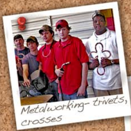
Metalworking- trivets, crosses