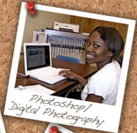
Photoshop/ Digital Photography