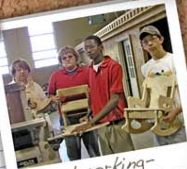
Woodworking- Children's chairs