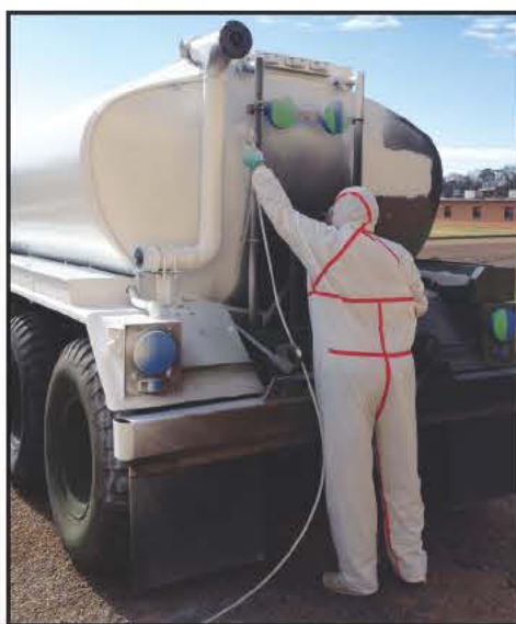
The Automotive/Welding class recently painted a tanker truck for a local fire department.